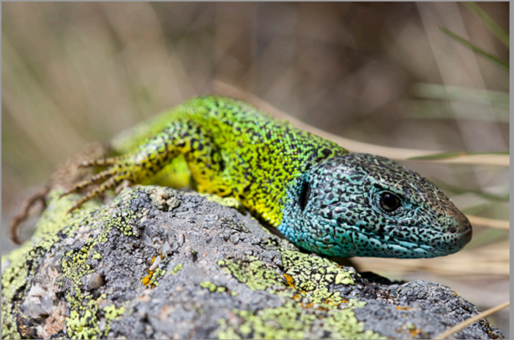
Lacerta schreiberi , male