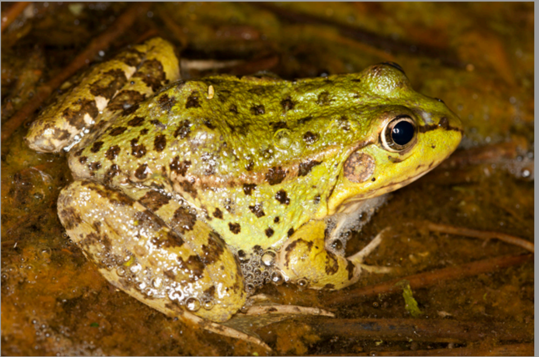
Pelophylax perezii is really abundant too