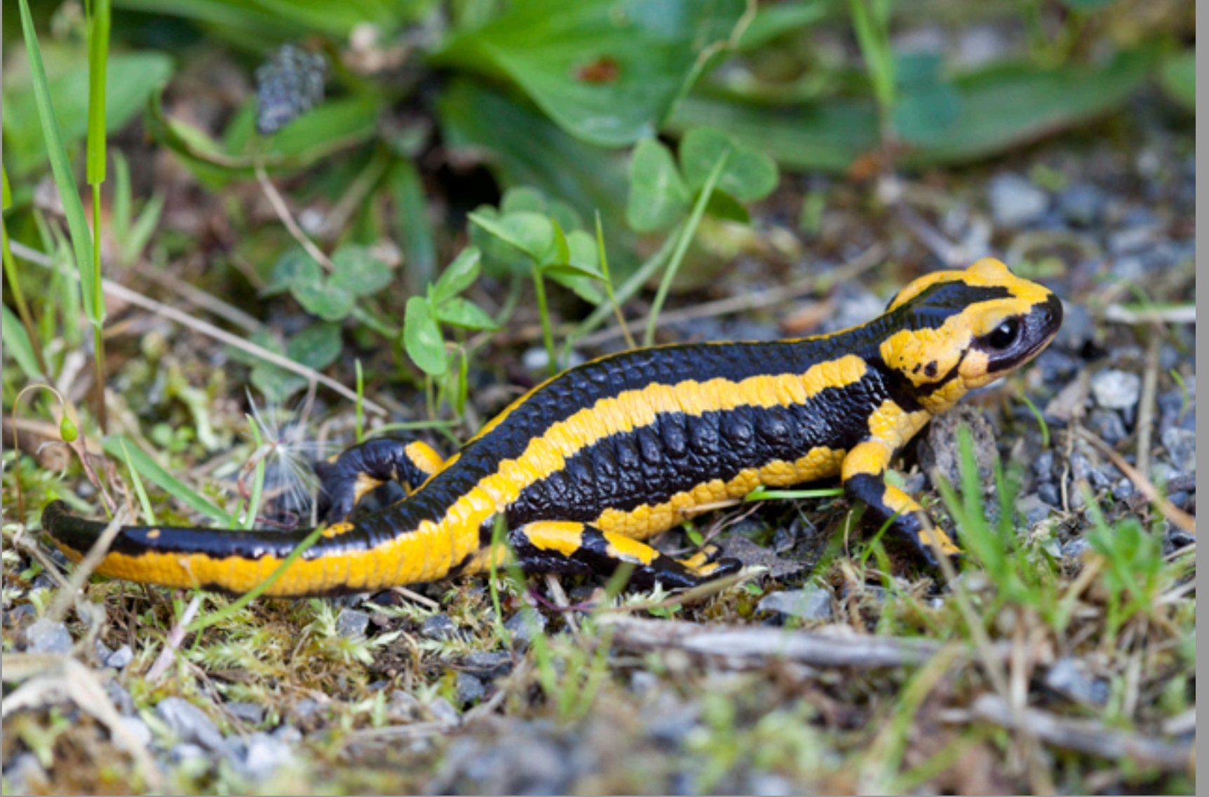
Salamandra salamandra bernardezi