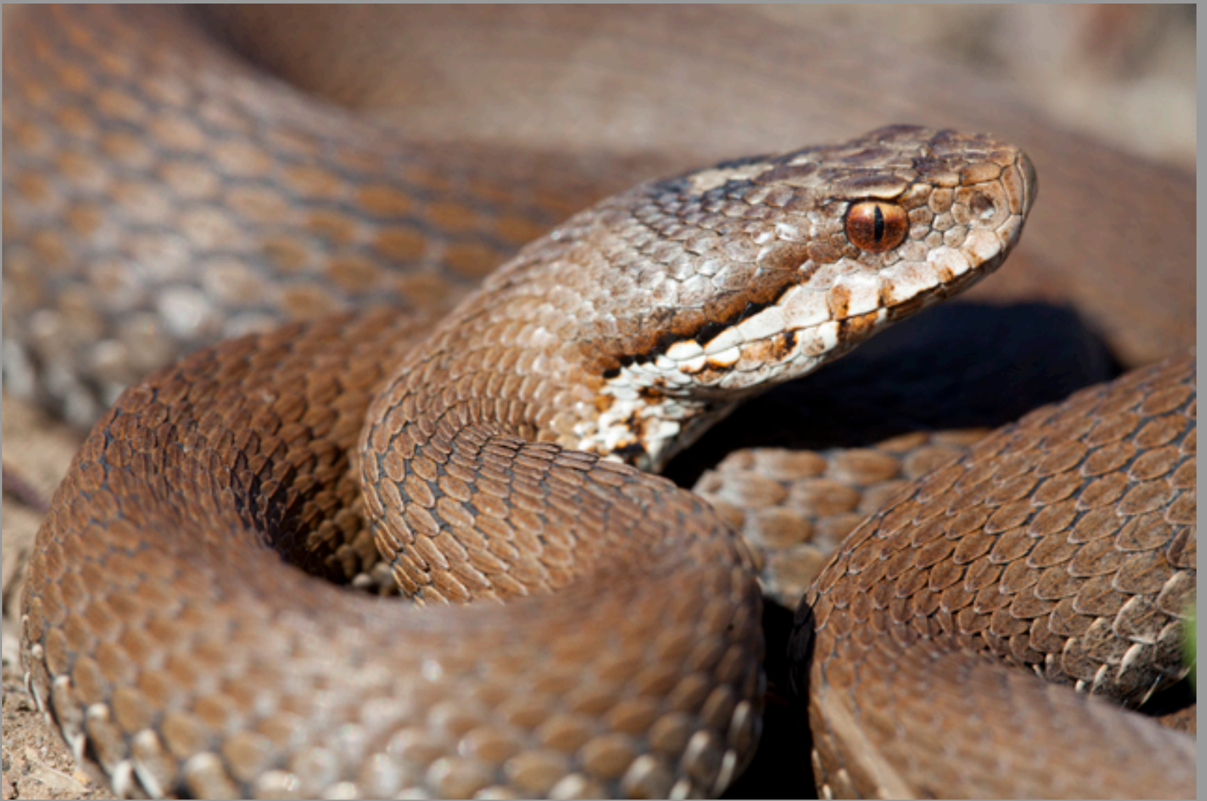
Vipera seoanei seoanei