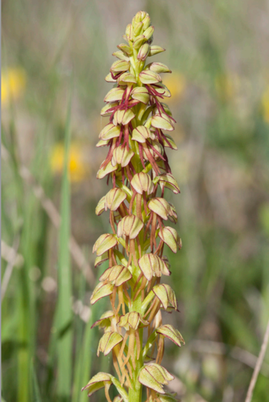
Aceras anthropophorum , very abundant