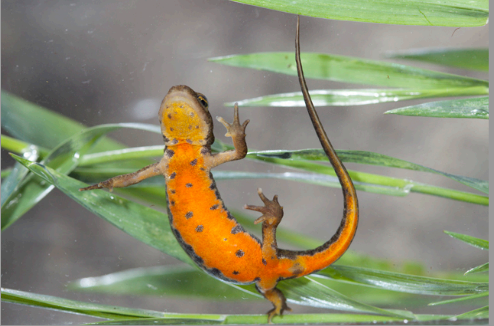
Lissotriton boscai boscai , female