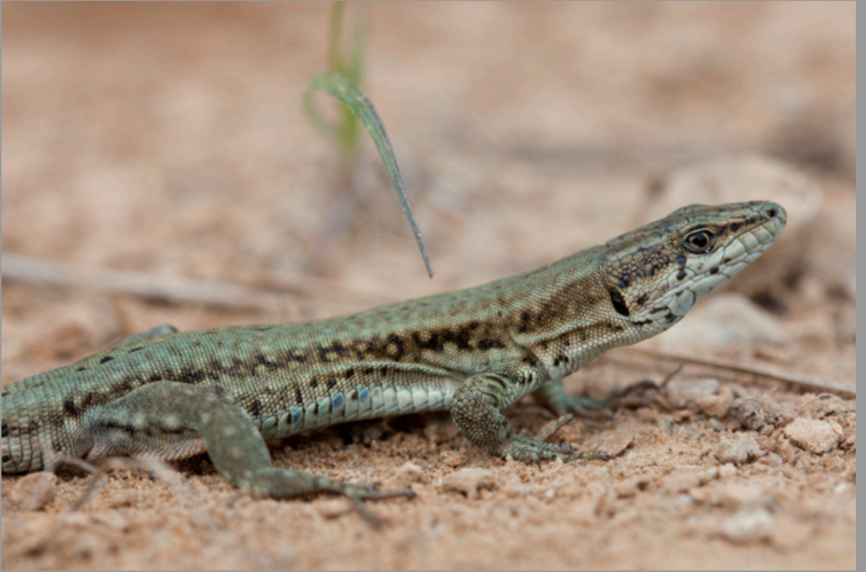
Podarcis liolepis liolepis