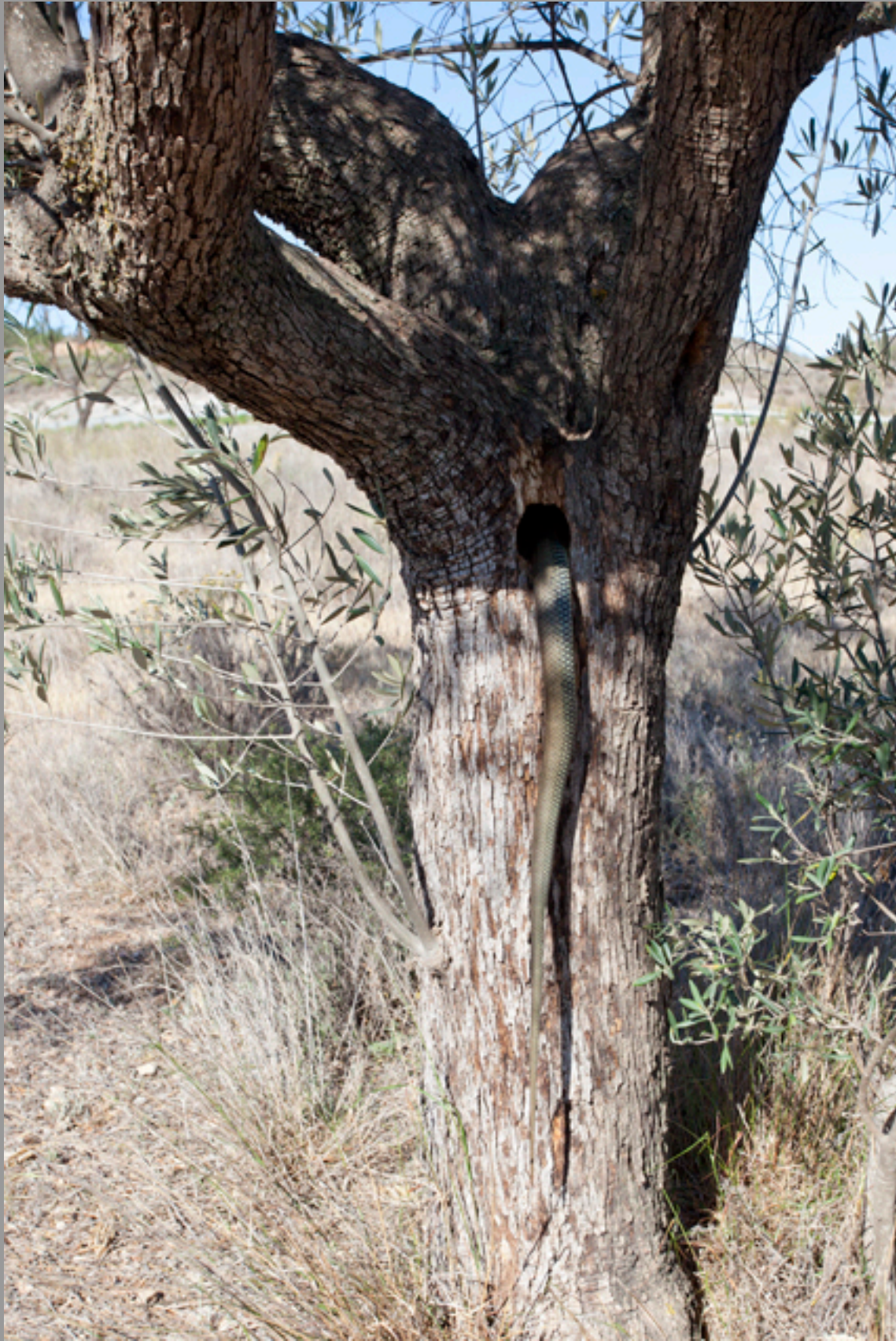
Malpolon monspessulanus , in situ