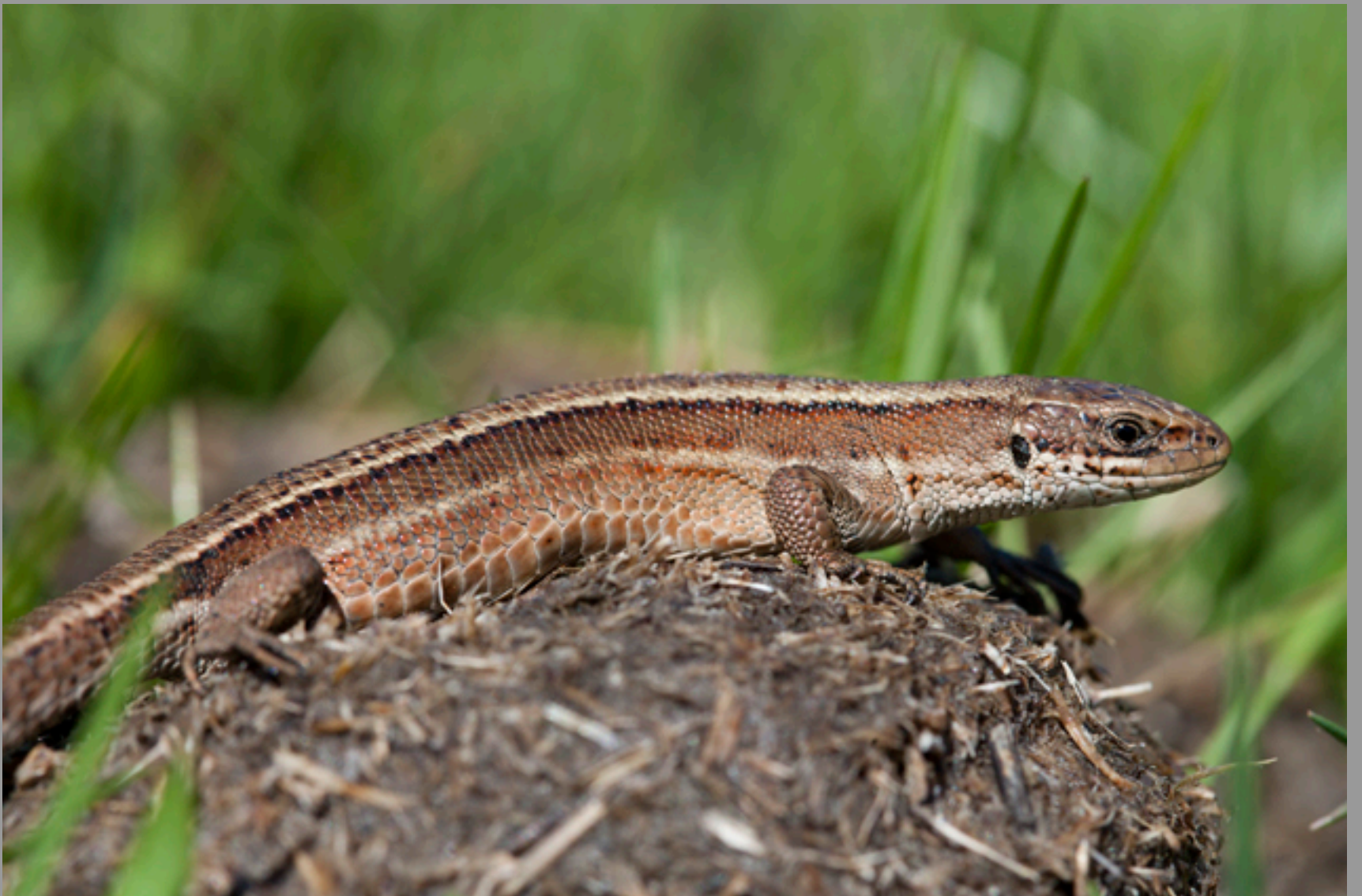
Zootoca vivipara louislantzi