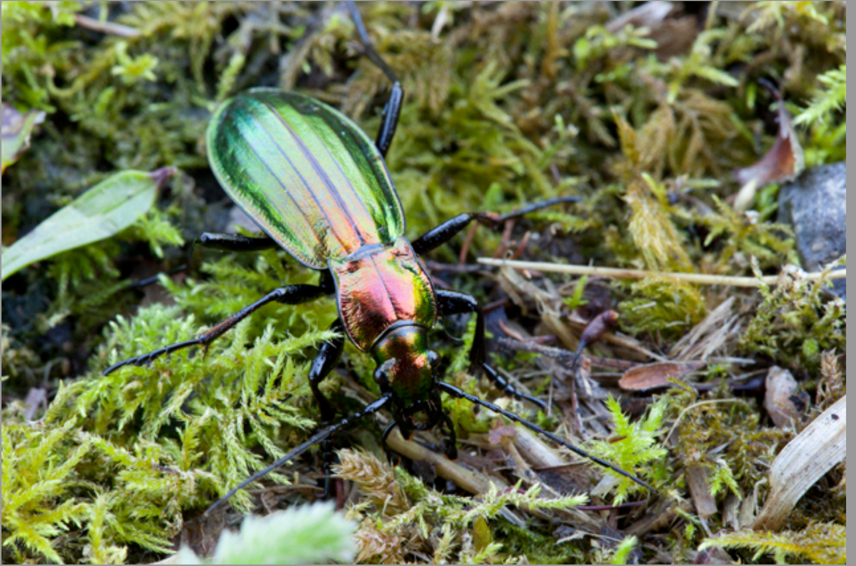
Chrysocarabus lineatus avilensis