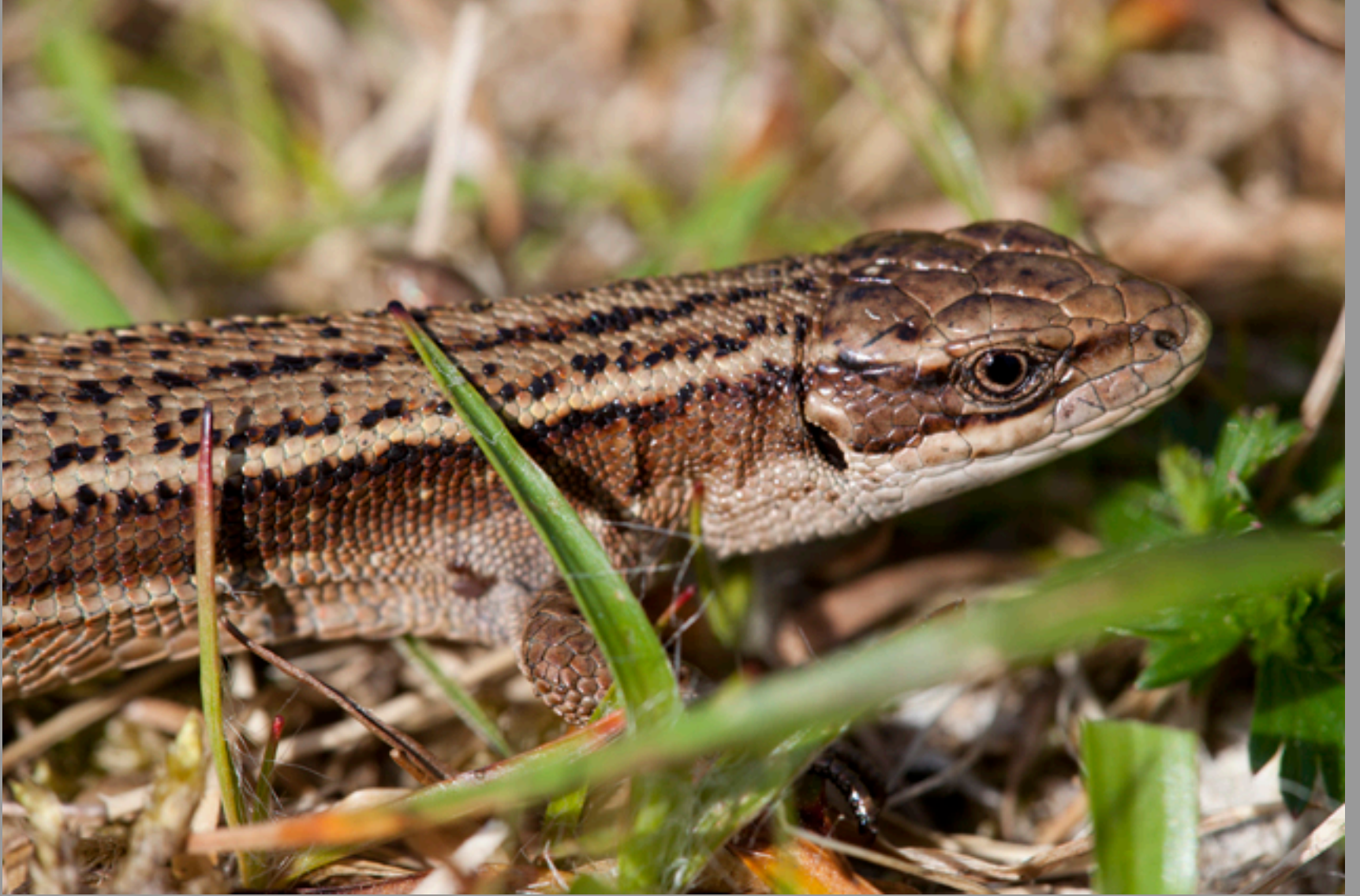
Zootoca vivipara louislantzi