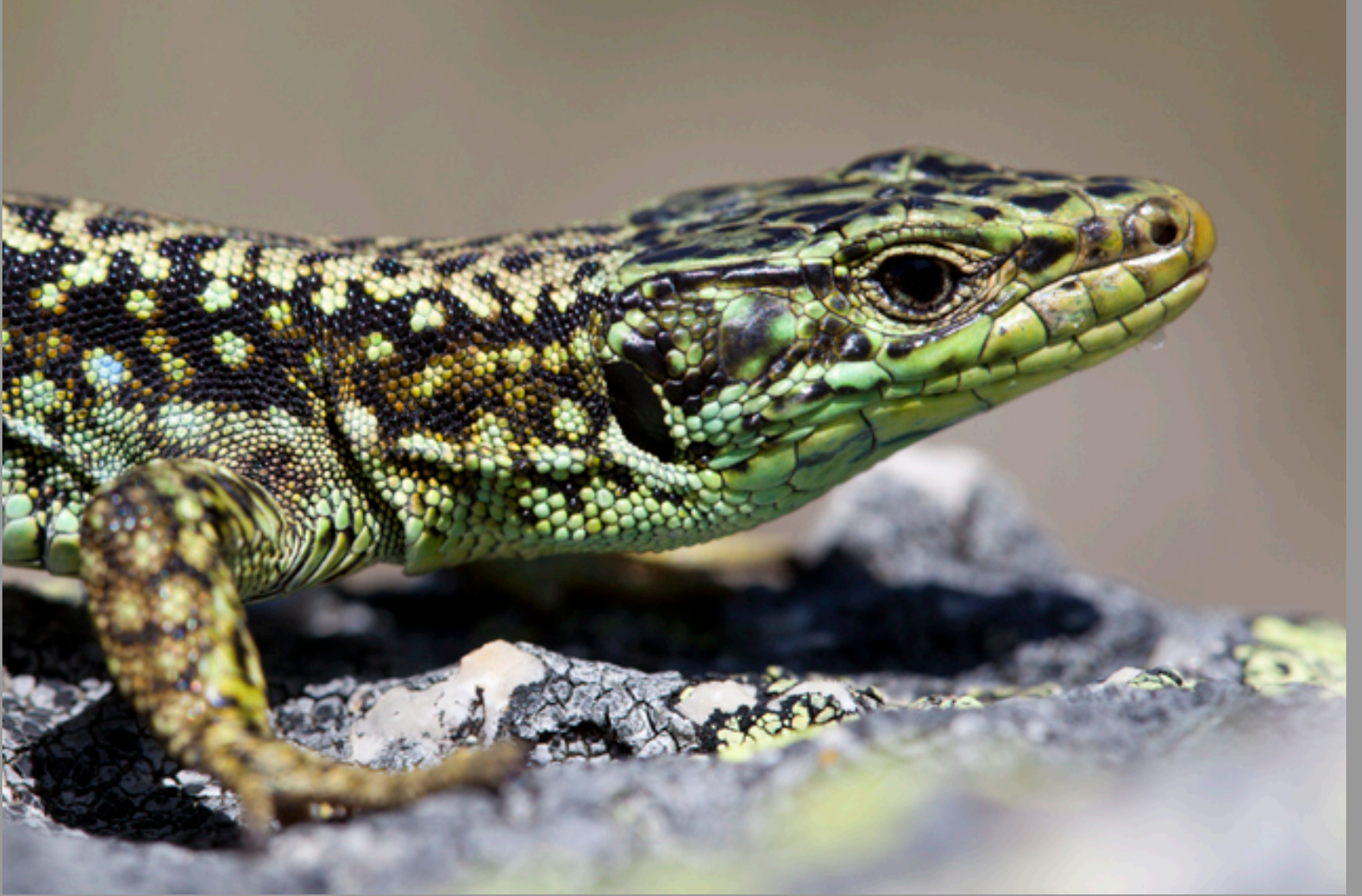
Iberolacerta cyreni castiliana