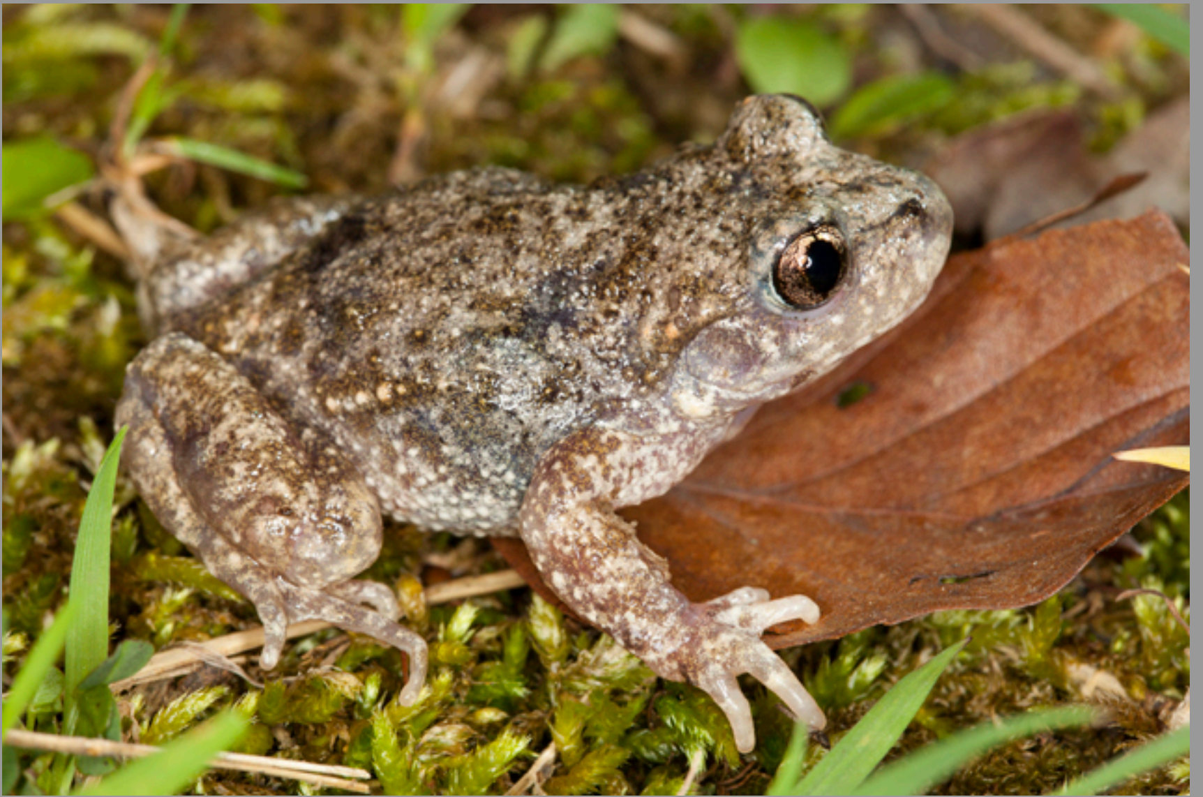
Alytes obstetricans obstetricans