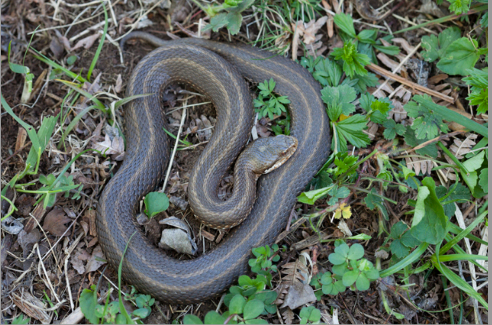
Vipera seoanei seoanei , morphotype ' bilineata '