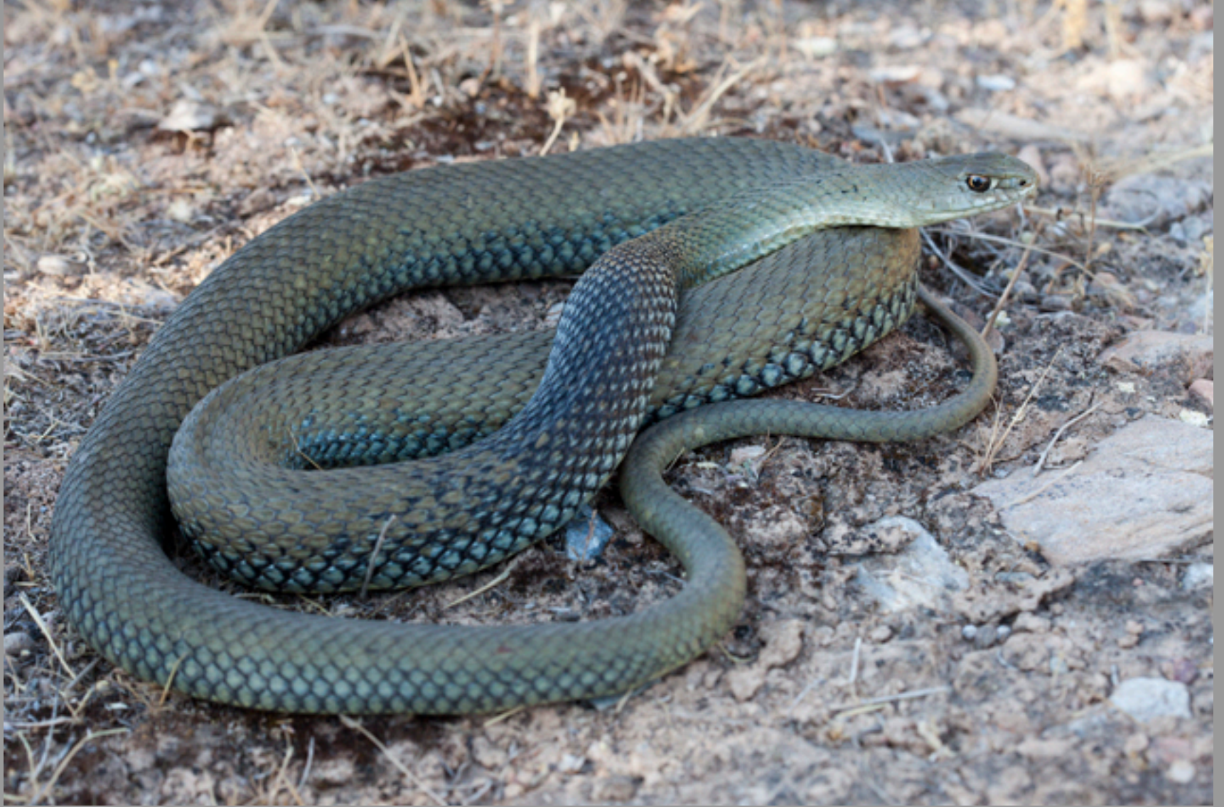
same, very big male but not so large (1,50m)