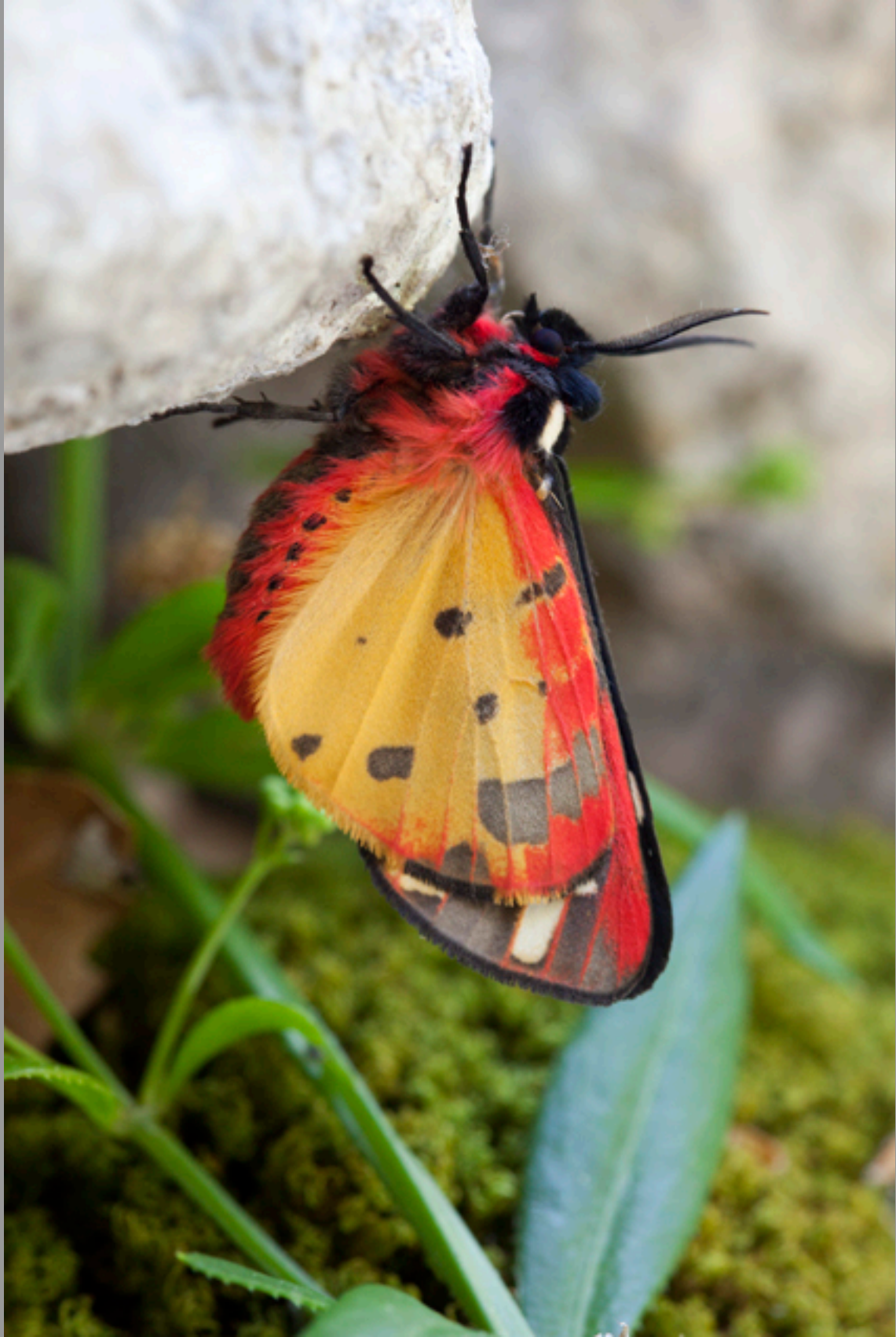
Epicallia villica , newly hatched