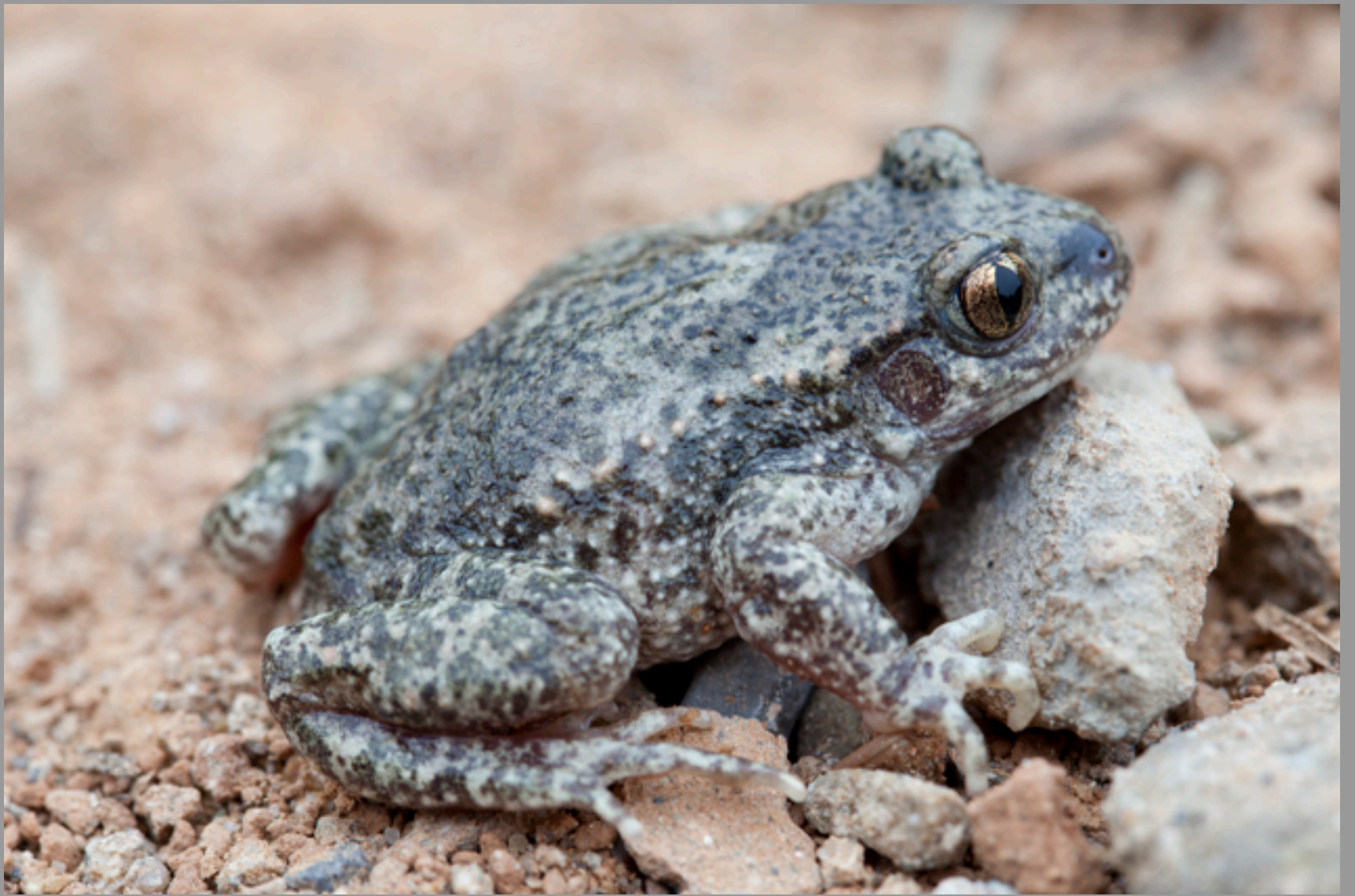
Alytes obstetricans almogavarii