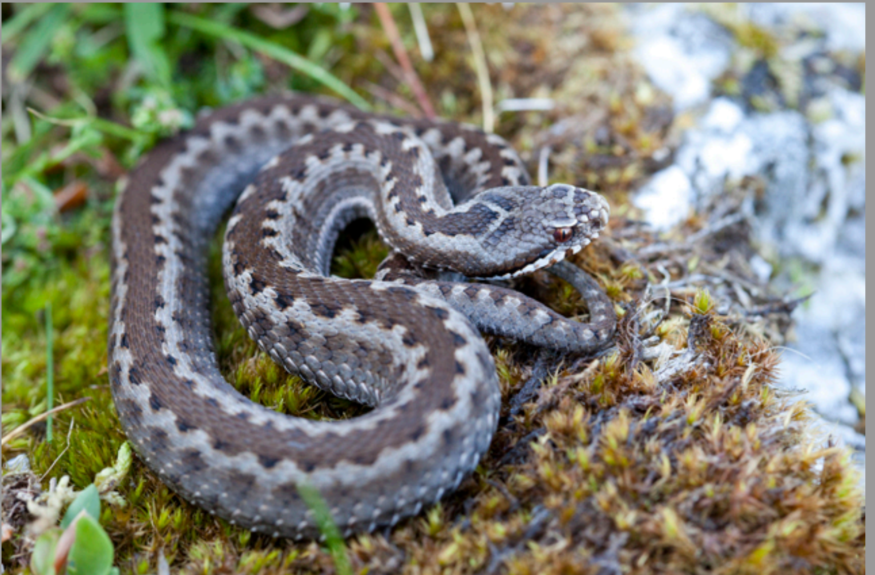
Vipera seoanei seoanei , young