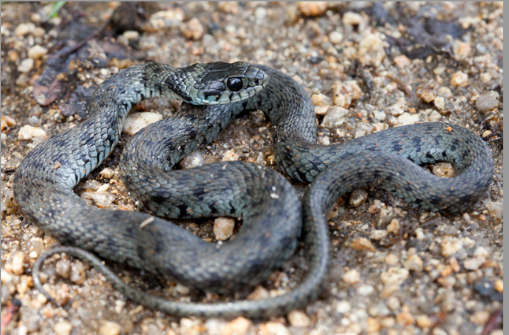
Natrix natrix astreptophora