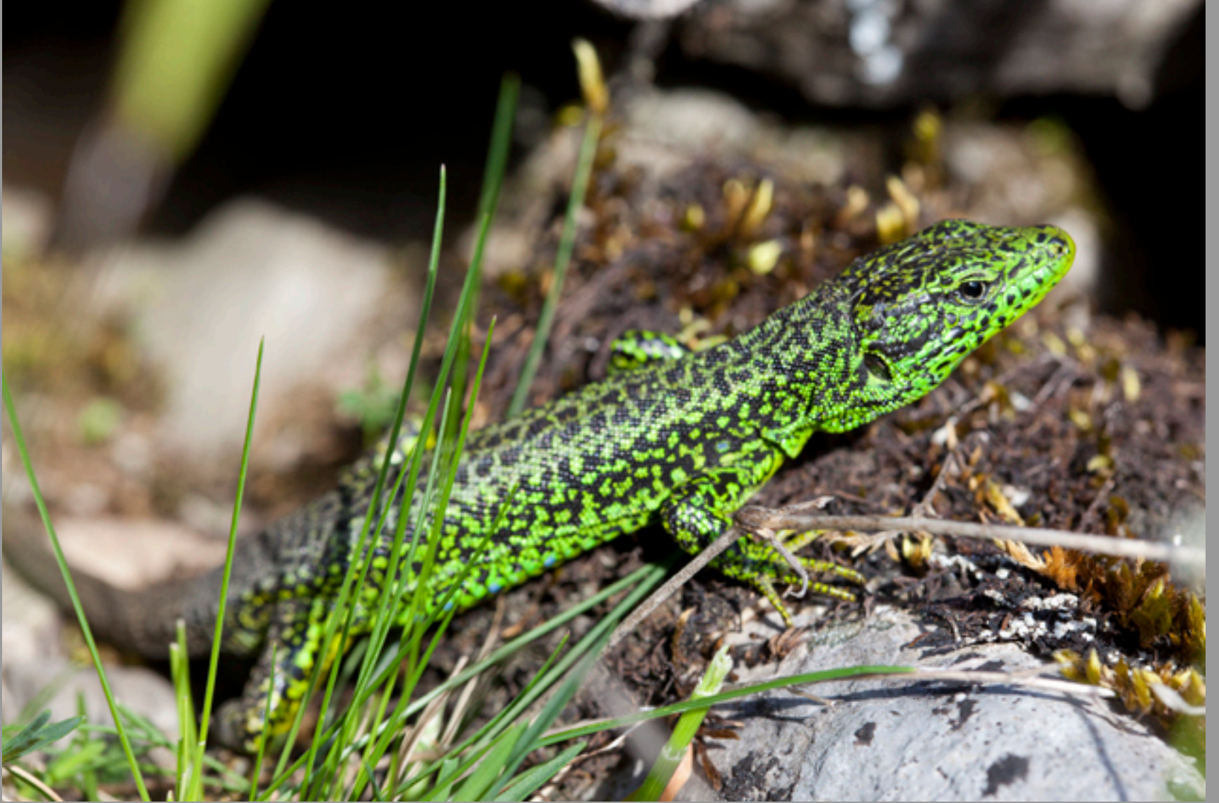
Iberolacerta monticola cantabrica