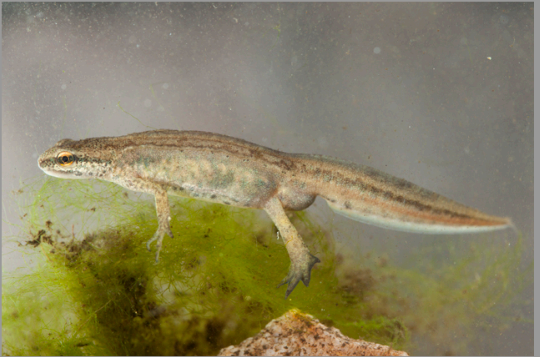
Lissotriton helveticus alonsoi , male