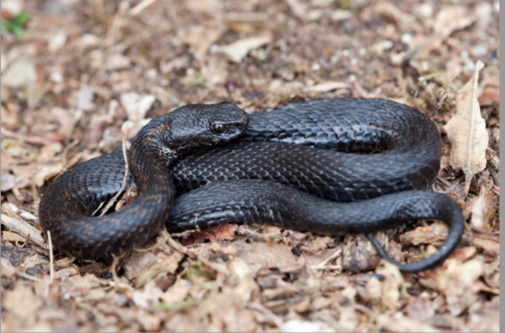
young black, very skinny