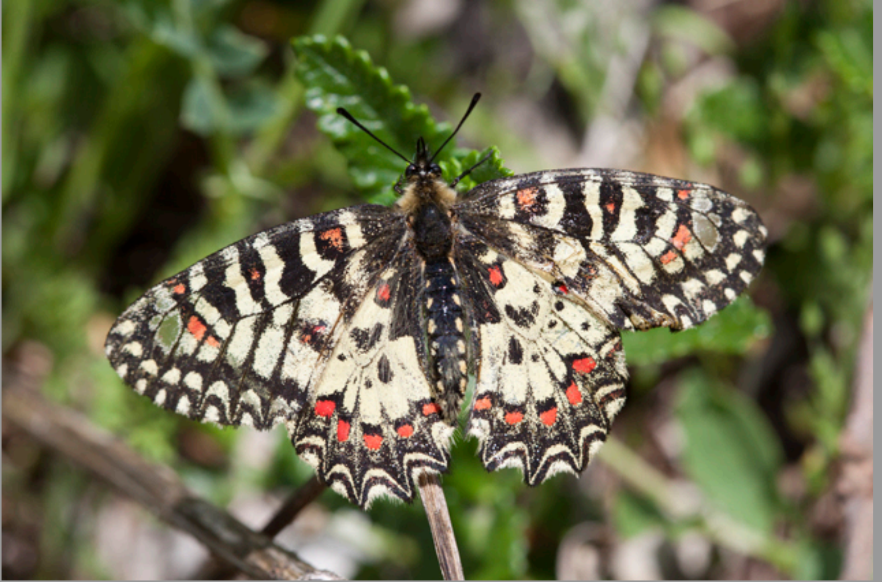
Zerynthia rumina rumina f. medesicaste