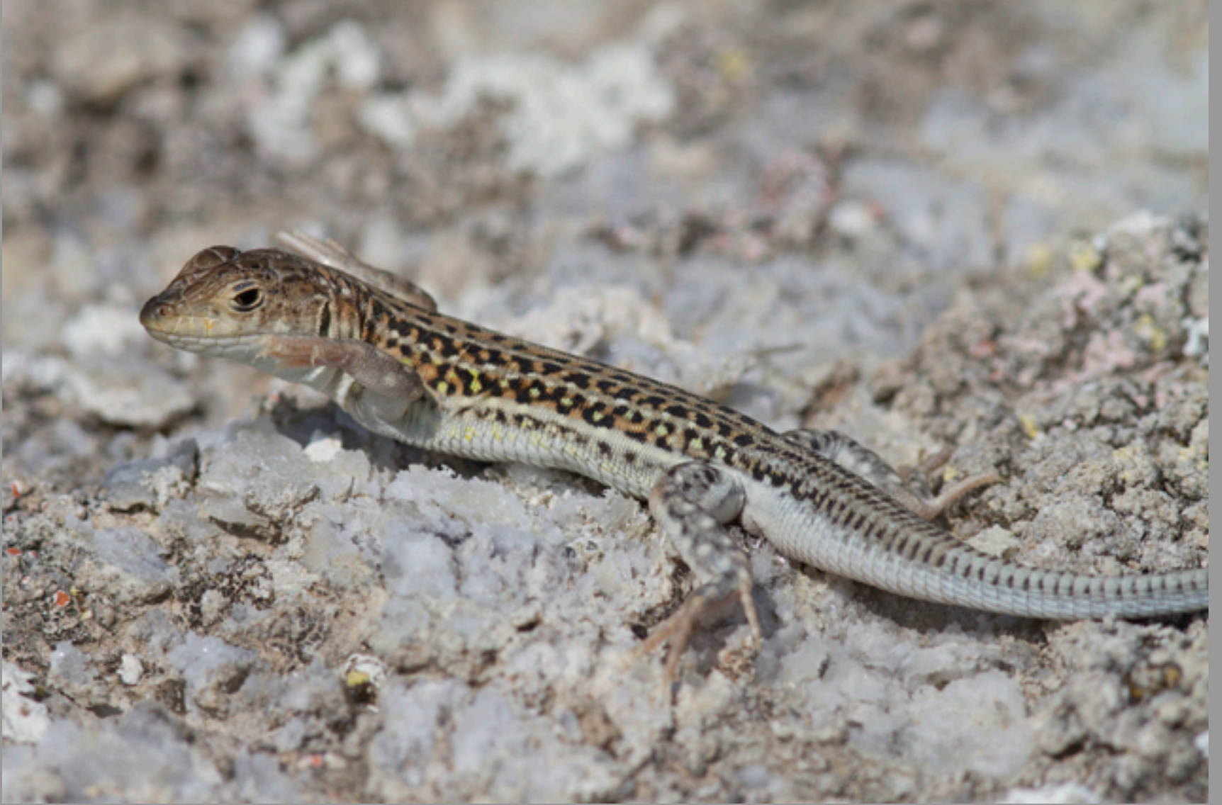
hot hot hot ! Acanthodactylus erythrurus