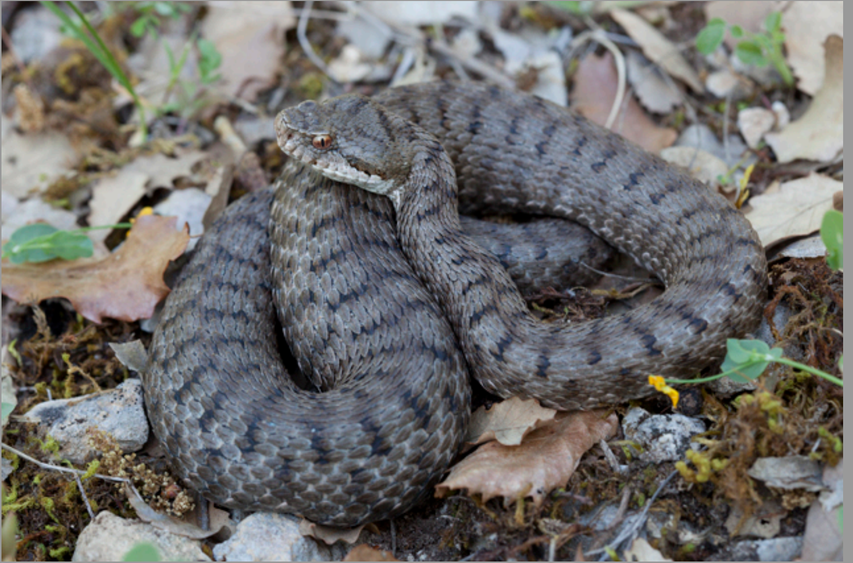
Vipera aspis aspis