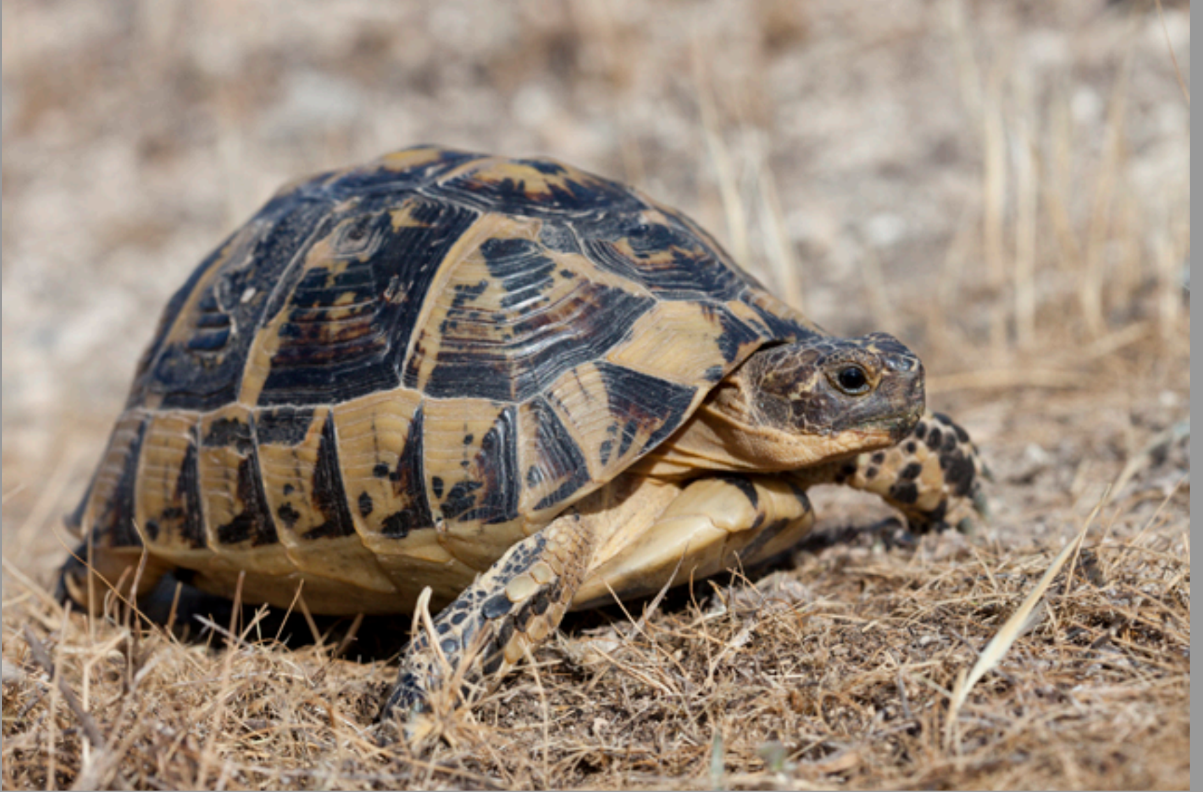
Testudo graeca graeca