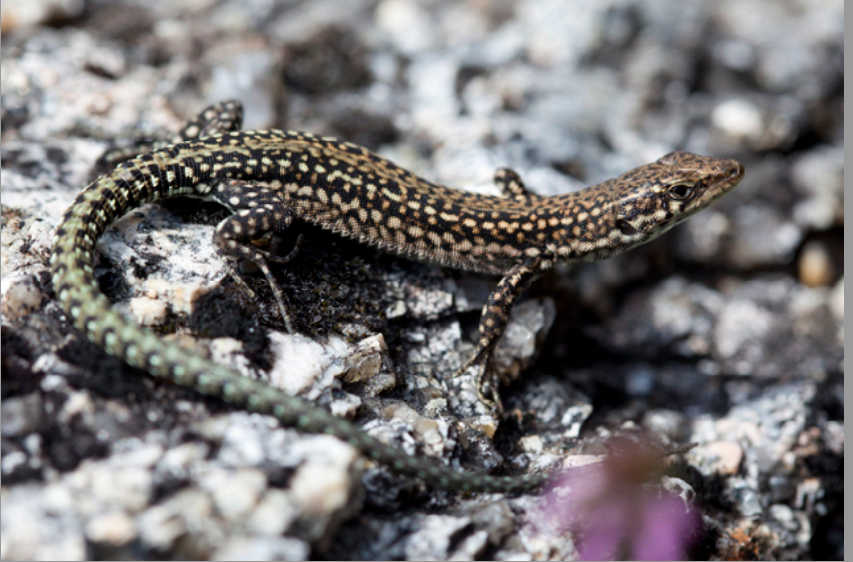
Podarcis guadarramae lusitanicus