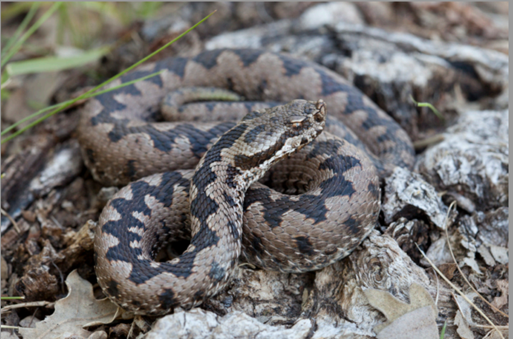
Vipera latastei latastei