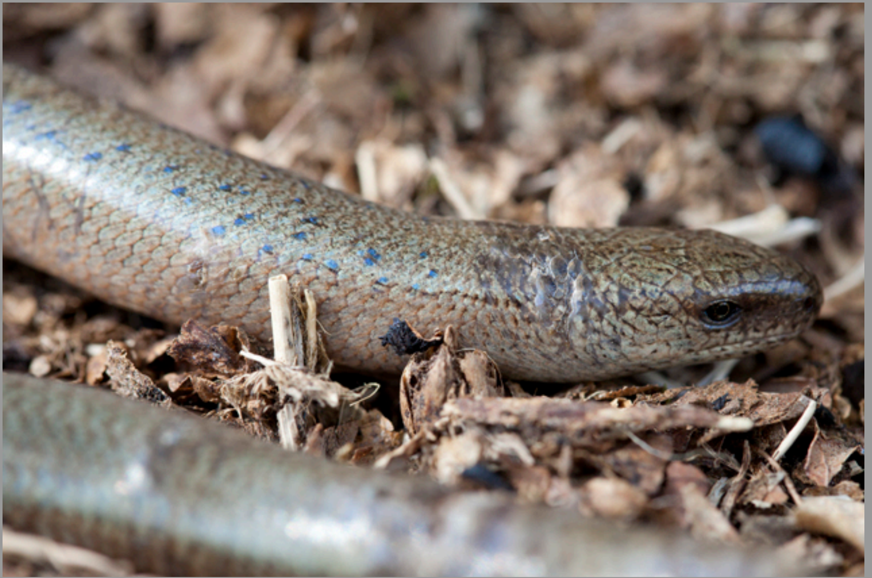
Anguis fragilis with blue spots and a lot of scars probably made by a snake