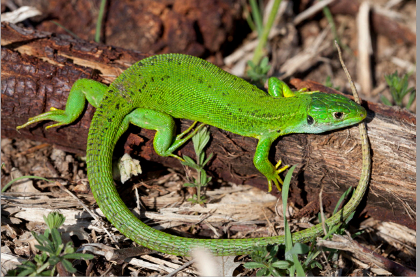
Lacerta bilineata , gravid female