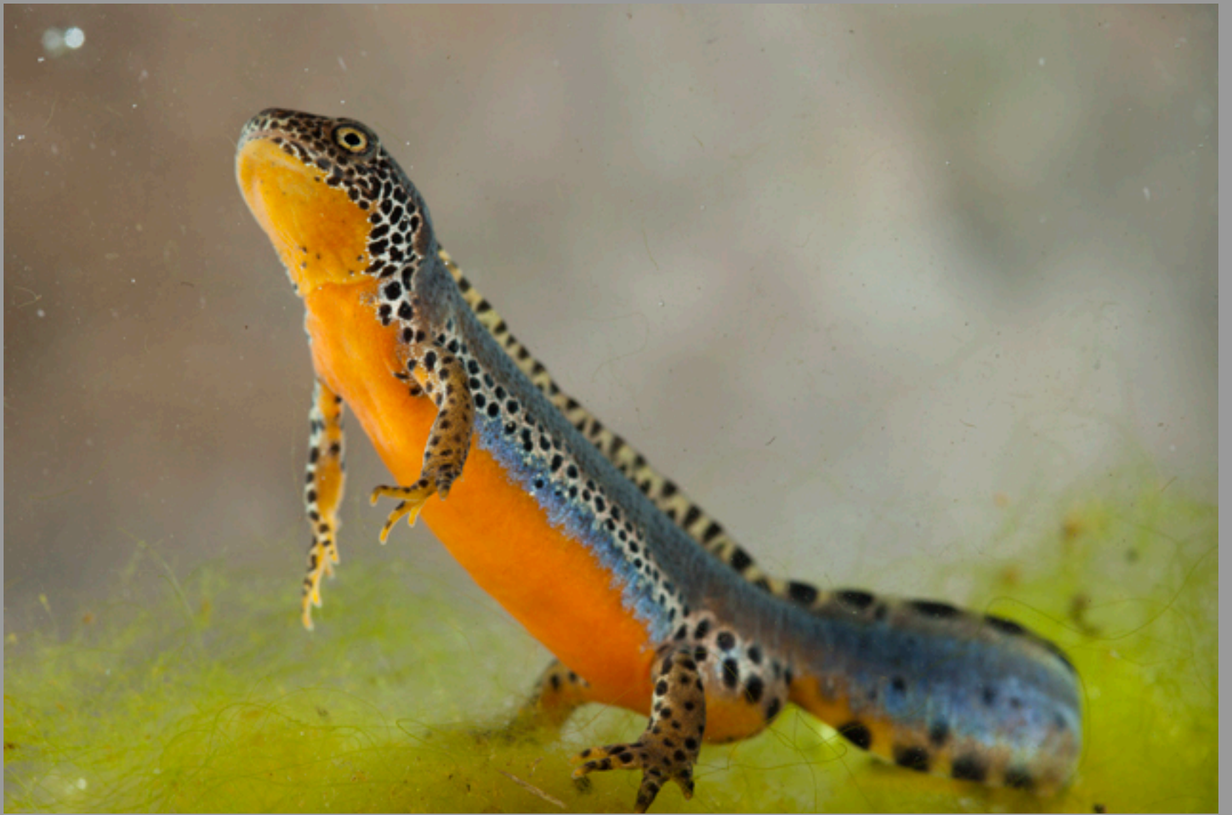
Ichthyosaura alpestris cyreni , male