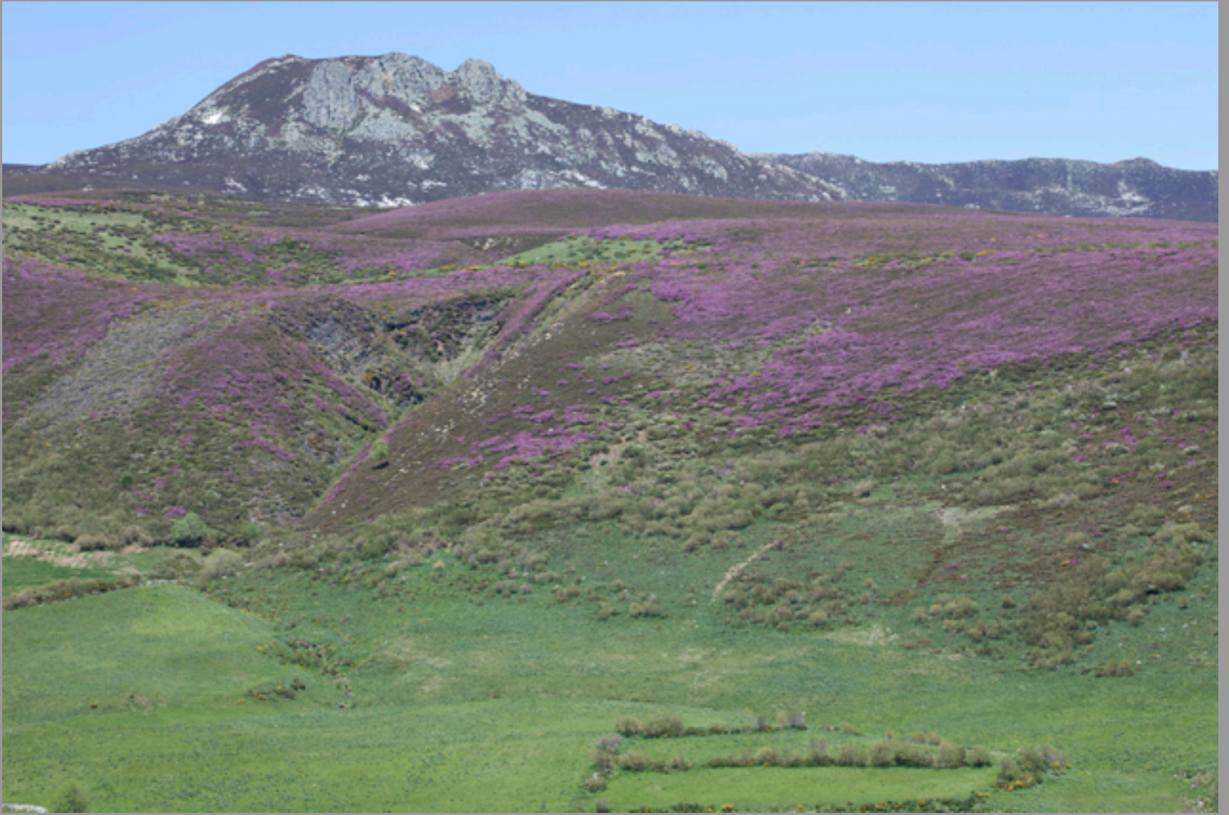
habitat of Vipera seoanei seoanei