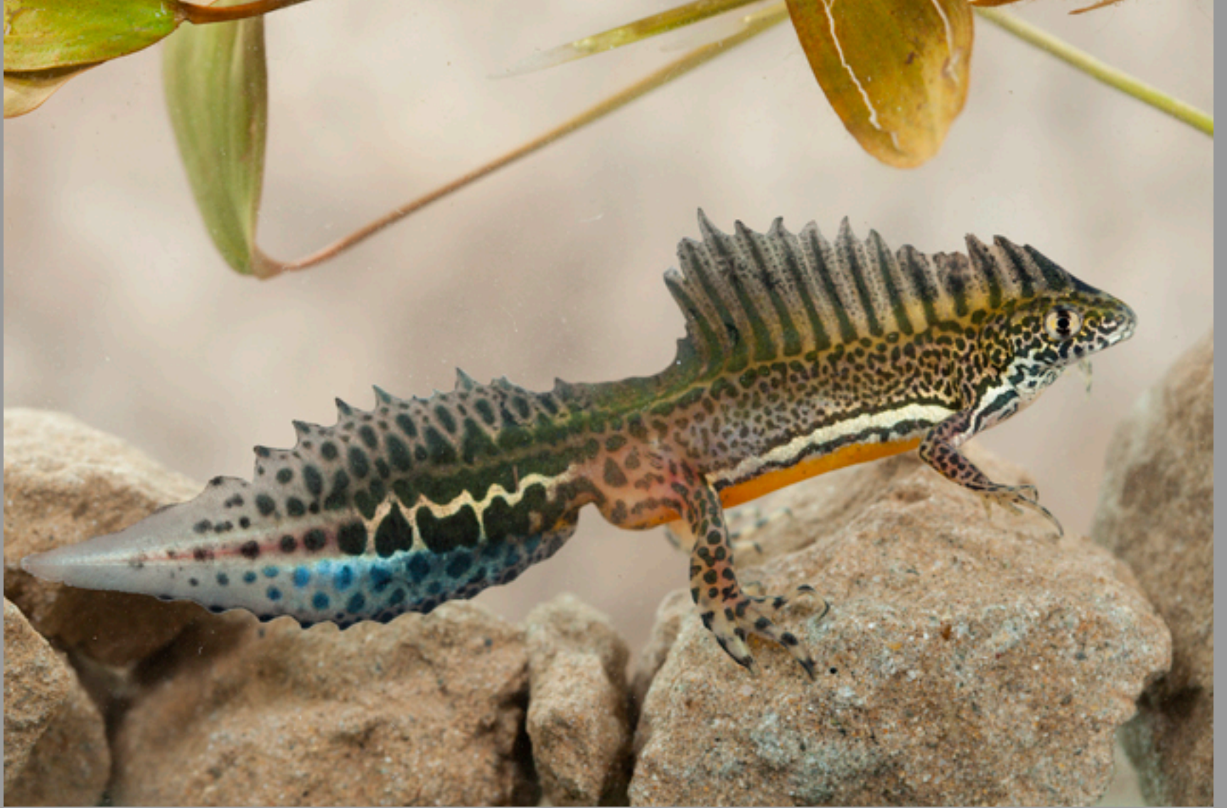
Ommatotriton ophryticus , male