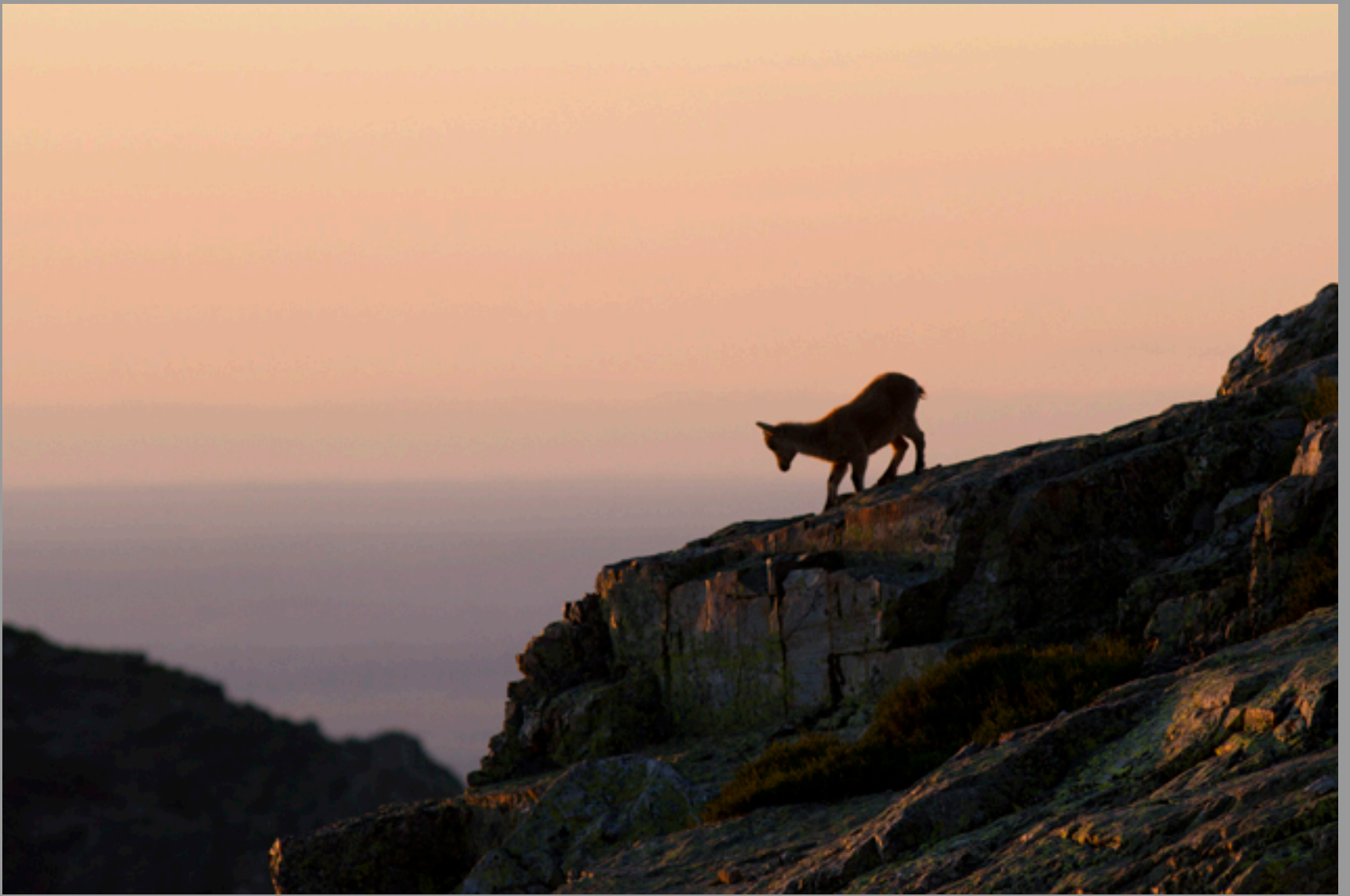
young Capra pyrenaica