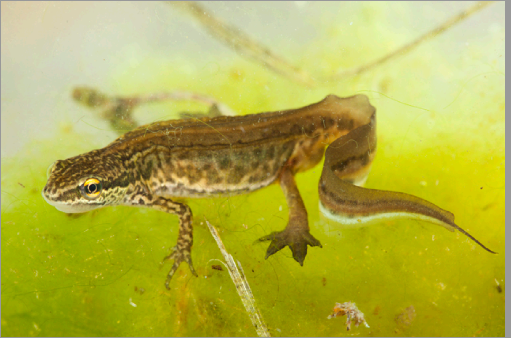
Lissotriton helveticus alonsoi , male